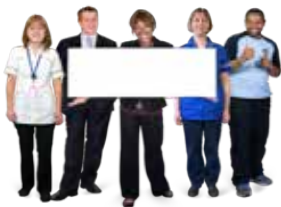
Our human rights

3. Protect and respect the human rights of staff and people using public services.